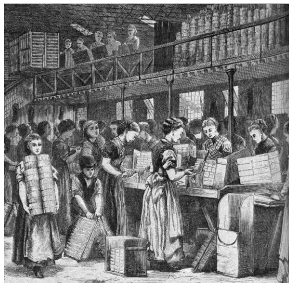
Figure 1 - Women cutting and boxing matches in a match factory in London, 1871. Public domain.

Geist, 1848 ). After dried, the splints of wood would be removed from the frame, cut in the middle, counted and boxed as shown in Figure 1 ( von Bibra and Geist, 1848 ; Roberts et al., 2016 ; Lehman, 2017 ).